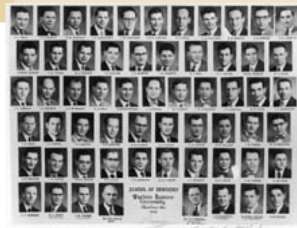
CLASS OF 1953

Please arrive Friday, May 16, 2008 in time to be a part of your class photo.