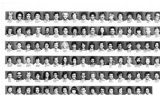
SCHOOL OF DENTISTRY Class of 1983

To volunteer, contact the Office of Development & Alumni Relations toll-free (877) 468-1436 or dentalalumni@case.edu