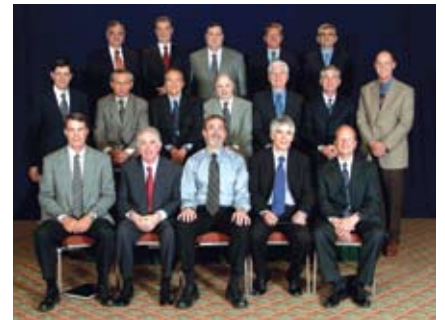
CLASS OF 1974