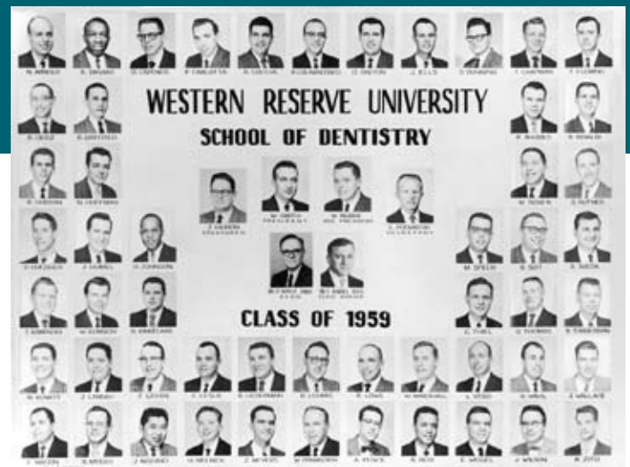
CLASS OF 1959

Go online to sign up at www.case.edu/alumni/directory