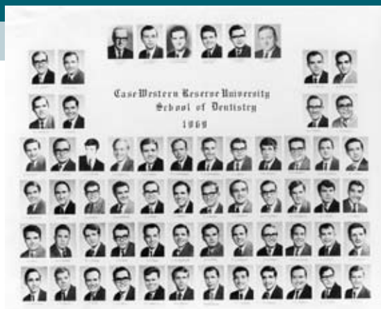
CLASS OF 1969

The staff in the Alumni Office is available throughout the reunion planning process to assist you. Their goal is to work with class representatives to ensure a fun and successful reunion. To volunteer, contact the Office of Development and Alumni Relations toll free (877) 468-1436 or dentalalumni@case.edu .