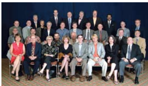
CLASS OF 1979