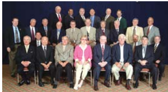
CLASS OF 1964