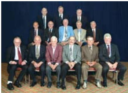
CLASS OF 1959