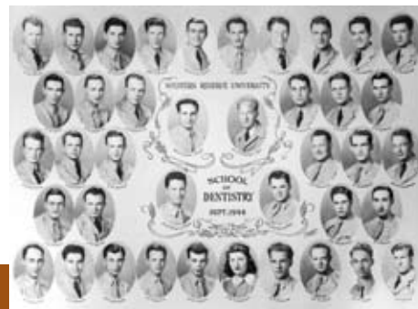
CLASS OF 1944

The Distinguished Alumnus Award is the highest honor bestowed by the Case Western Reserve University School of Dental Medicine Alumni Association. Since 1961, the school has been presenting the award to the most prestigious graduates of CWRU School of Dental Medicine for their professional achievements, contributions to society and support of the university. Eligible alumni include those who have demonstrated continuous, outstanding, creative and exemplary contributions to the discipline of dental medicine or to healthcare or have made noteworthy contributions in other fields. Nominations are due no later than October 15, 2008 . Go to our website and click on the Distinguished Alumnus Nomination Form for nomination information - http://dental.case.edu/alumni/resources.html .