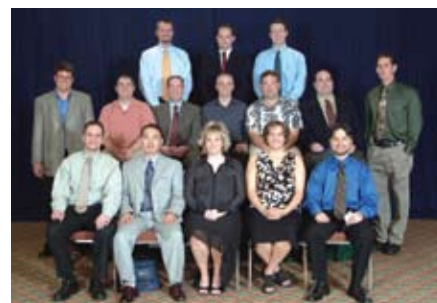
CLASS OF 1999