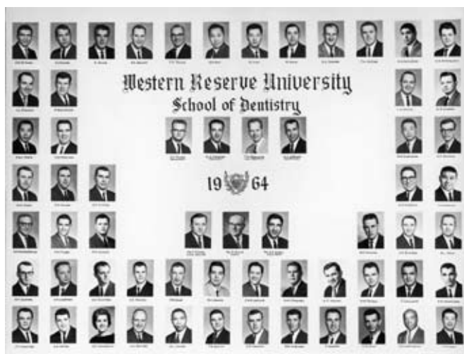
CLASS OF 1964

Commencement for the Class of 2009 2:00 p.m. Church of the Covenant, Campus