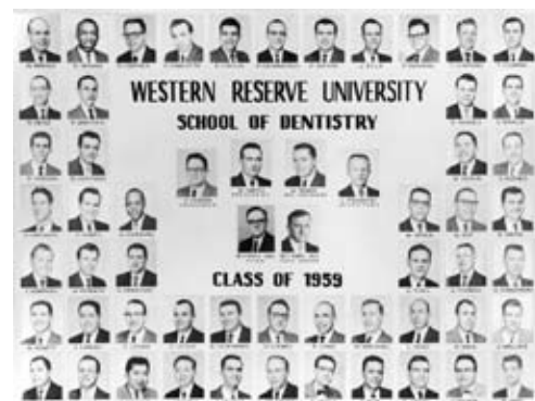
CLASS OF 1959