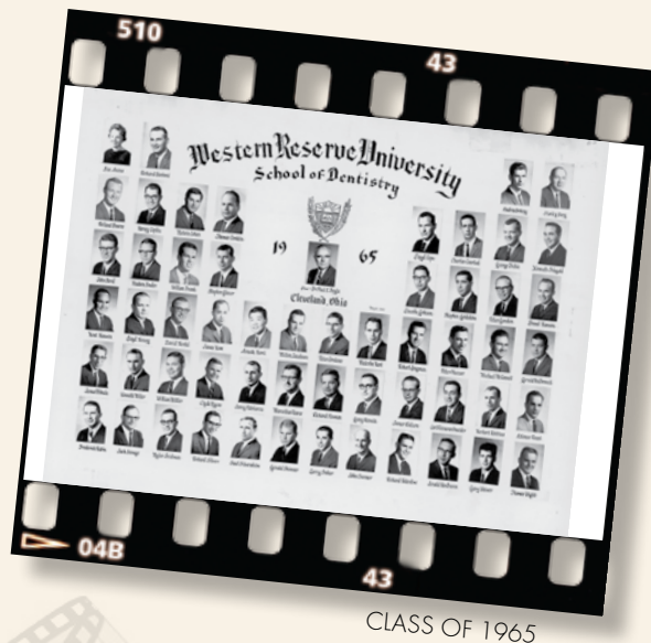
CLASS OF 1965

Join the Wyndham chef in a rare, up close experience of creating a delicious lunch. This hands-on course will give you some tips and tricks that you can use in your own kitchen.